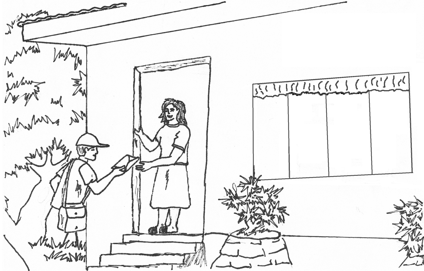
Sala gendaw duun minateng sulat ni Ina`.